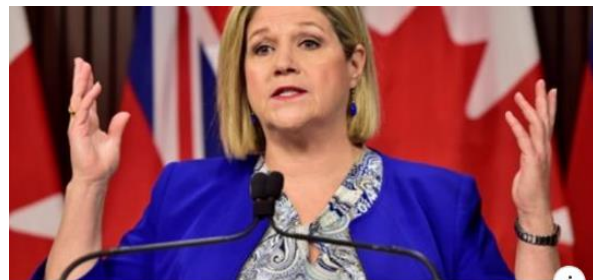
CBC.CA Ford government to scrap LHINs, create new health care 'super agency,' NDP says | CBC News