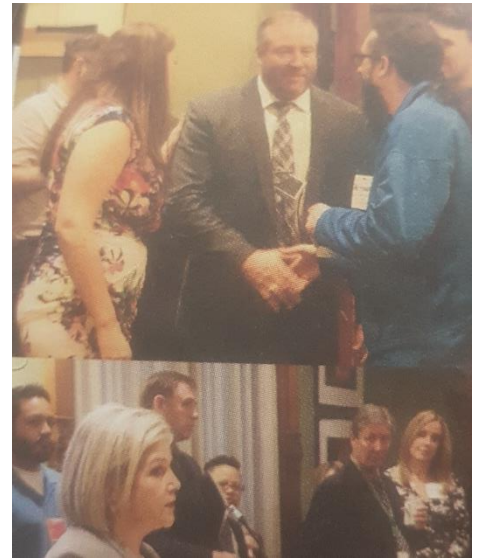
We finally made The Update!

OSSTF/FEESO looks forward to future opportunities to engage MPPs from all of the political parties in ongoing discussions about ways in which the government can work with educators to protect and enhance public education.