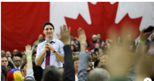
TORONTO.CITYNEWS.CA Trudeau concerned about possible education cuts by Ford government